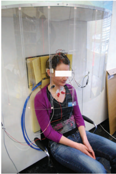
Figure 2. The participant sitting inside the head rotation angle apparatus.

one hour, video recording and attachment of EMG electrodes on their SCM muscle.