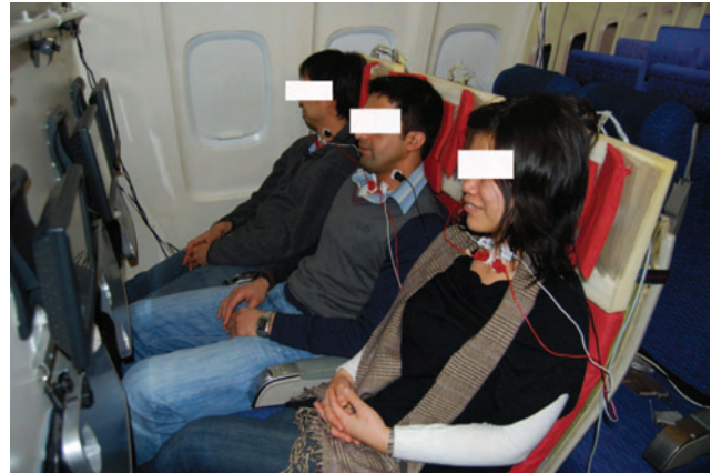
Figure 3. The setup of participants in the aircraft cabin simulator.

Two EMG modules of MP150 Biopac system were used for each participant. The aircraft cabin simulator was designed and built to simulate the average economy class cabin. Three smart neck support systems were installed in each aircraft seat. The computer was used for data logging and video recording. The CCTVs were installed in front as well as above the participant. The acquisition of EMG signal and procedure were the same as in the calibration experiment.